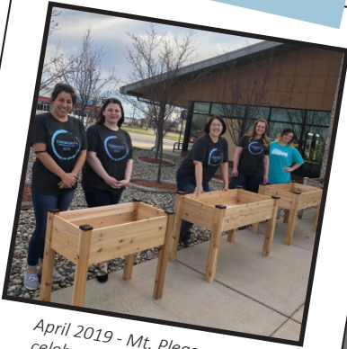
April 2019 - Mt. Pleasant staff celebrate Earth Day with their community garden