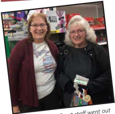
December 2019 - Ewart staff went out in the community to perform random acts of kindness