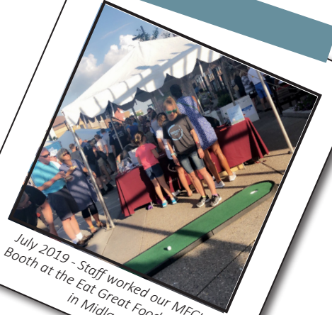
July 2019 - Staff worked our MFCU Booth at the Eat Great Food Festival in Midland