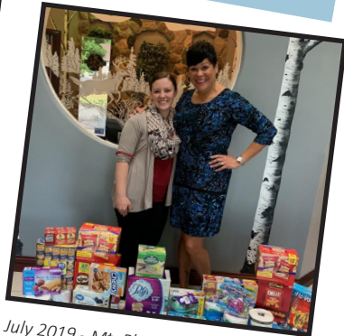
July 2019 - Mt. Pleasant staff dropped off their food donations our team had collected