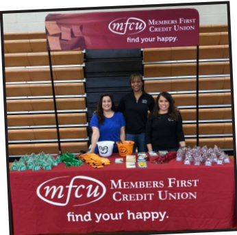
December 2019 - Grand Rapids staff worked the MFCU Booth at the Grandville Fall Expo