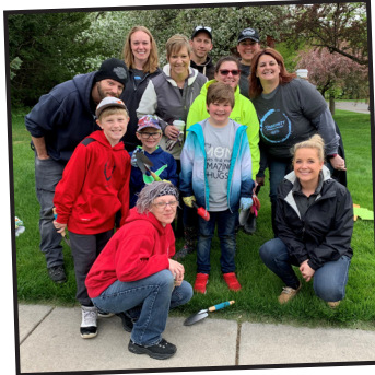
May 2019 - Midland staff had a great day volunteering at Midland Blooms