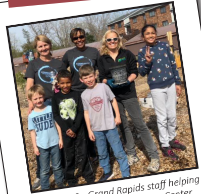
May 2019 - Grand Rapids staff helping at Discovery Days Learning Center