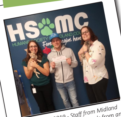
December 2019 - Staff from Midland were able to drop off proceeds from an Adopt-An-Organization drive